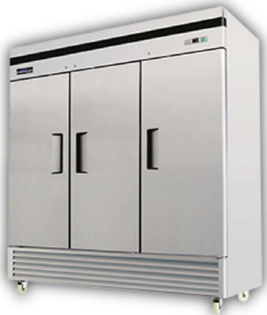
F-72R / F-72F