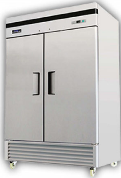
F-49R / F-49F