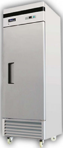
F-23R / F-23F